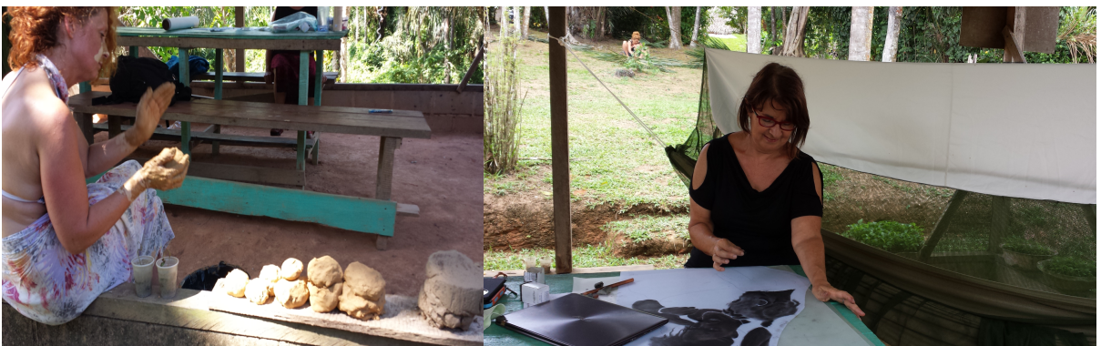
Artists at pop-up studio in Botopasi

We work with pop-up studios. You will have an inspiring work spot. In fact we have more than two acres of forest where we can work. A shady, cosy and private outdoor workspace with a spectacular view on the river or a stream. During the residency participants can have a studio at their disposal.