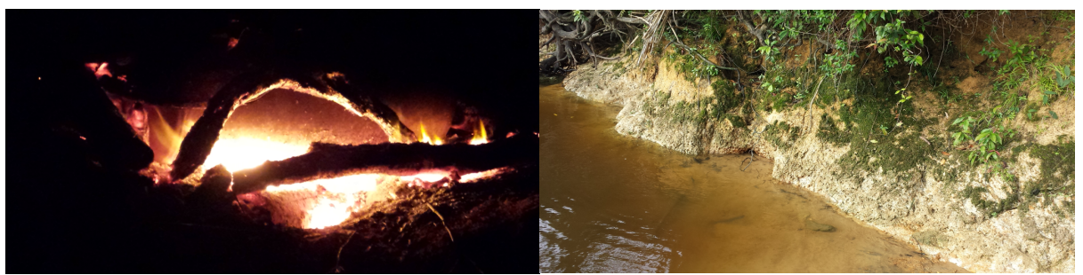
Kiln and river clay

ARTCEB builds and maintains its contacts in order to sustain, strengthen and expand its international network. Former residents and organisations will be invited to team up with ARTCEB to join and participate in future exhibitions, events and projects at hand.